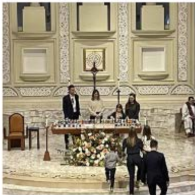
Grade 3 First Reconciliation