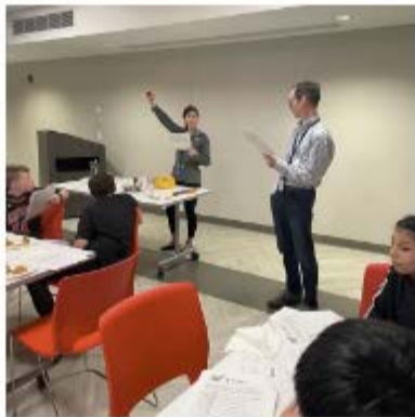
Grade 6 Seder