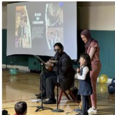
Celebration of Eid